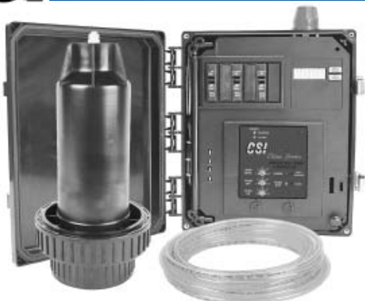
Sub-Door Control Center